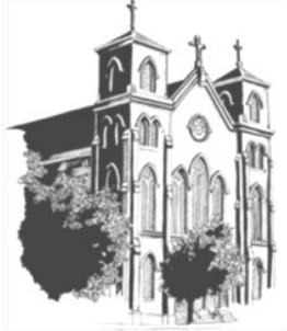
Emmanuel Church 1837