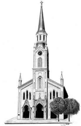
Holy Trinity Church 1861