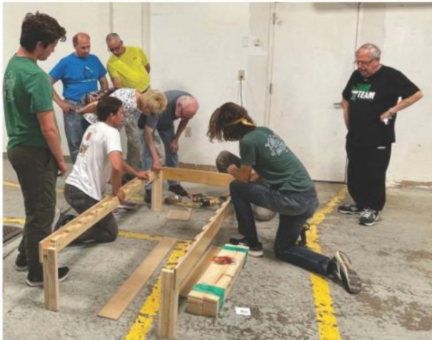
Missionaries build beds with the Emmanuel SVDP Conference.