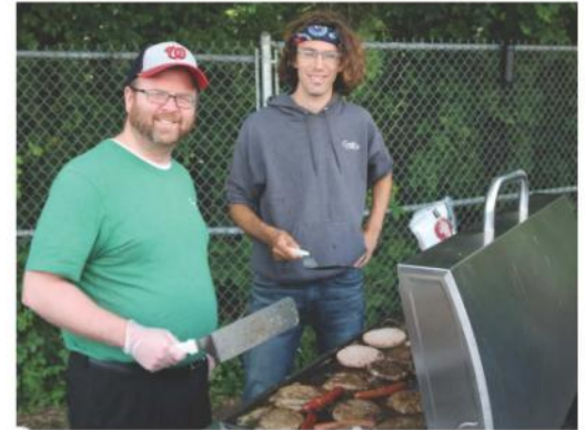
Christ in the City grilling for our guests!

This quote by St. Mother Teresa emphasizes the isolating characteristics of the homeless experience. While there are many causes of homelessness, the greatest root is broken relationships. The more isolated a person becomes, the less likely they are to discover (or even desire) healing. Christ in the City is a mission dedicated to addressing this need for human connection. With the love of Christ, they encounter people experiencing homelessness in friendship. Friendship can help restore a person’s sense of dignity and begin a journey of healing. This summer, our shelters were blessed by the presence of eleven of these missionaries over the course of a few weeks. They spent time with guests in shelter, listening to them, laughing with them, crying with them, praying with them, and serving them. We are thankful for the gift of their presence!